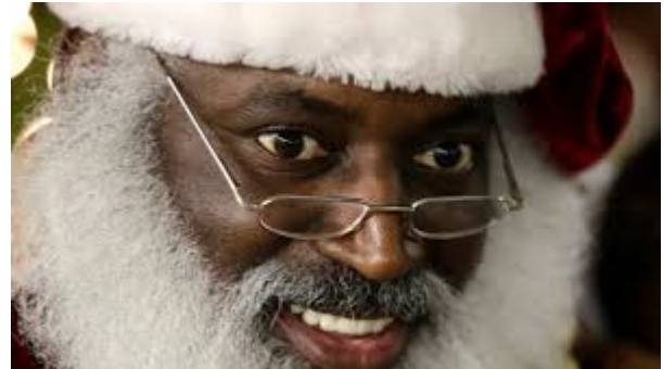
Merry Christmas everypony